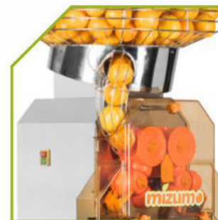
Feeder with 20 kg capacity and mechanical locking.