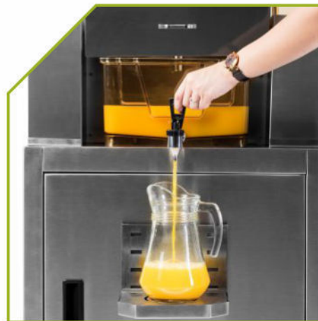
Height adjustable stainless steel drip tray.