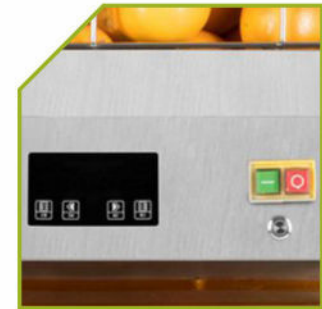
Programmer and orange counter function.